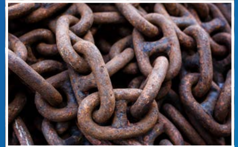
Second Hand Chain