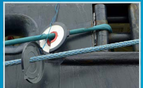
Multi Angle Fairleads