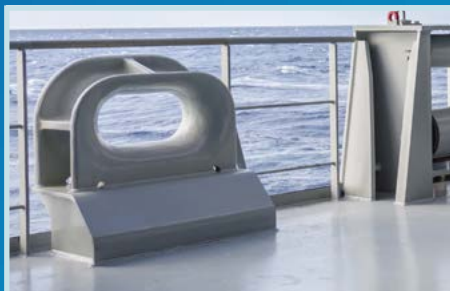
Deck Mounted Chocks